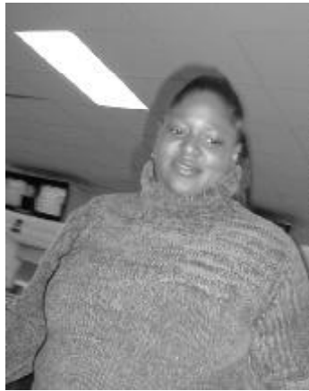
"This was all my idea..."