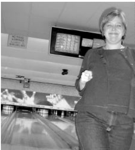
"That's what I'm talkin' about!"