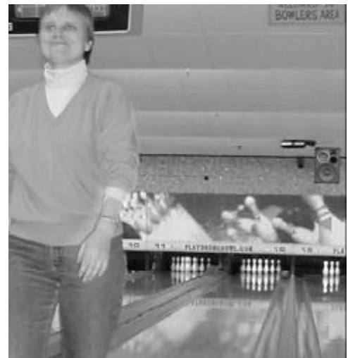
"The lane must have a tilt to it..."