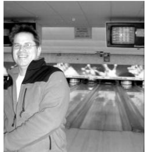
"Did I do that?"