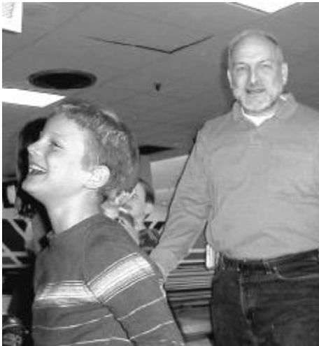
"What do you mean? ...Three strikes is a good thing."