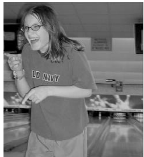
"You owe me twenty buck!"

Friday, May 2 nd is the next bowling night. Meet in front of St. Matthew's at 6:30 PM to car-pool to the lanes on Rt. 440.